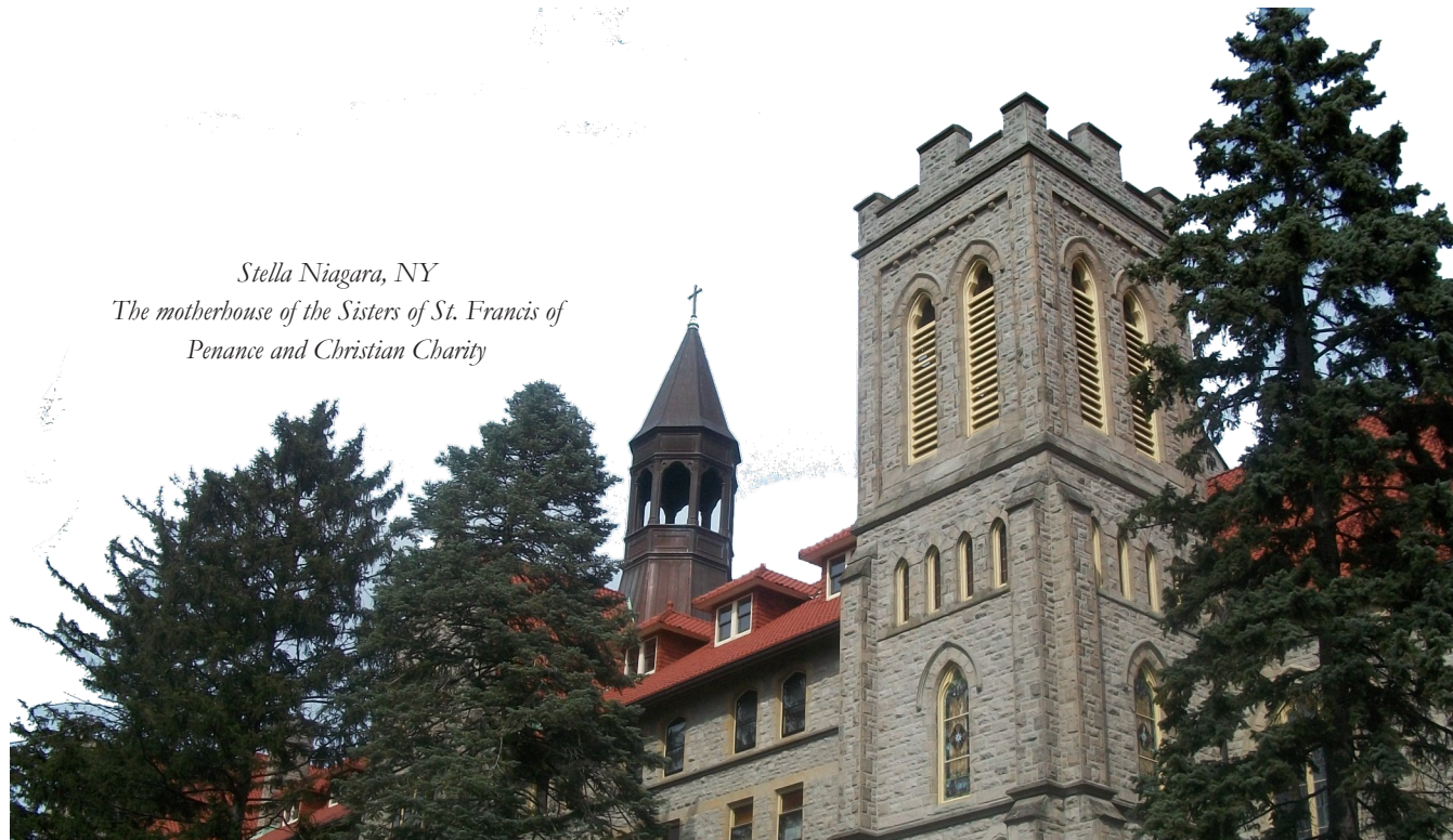
Stella Niagara, NY The motherhouse of the Sisters of St. Francis of Penance and Christian Charity

Contact our Office of Associates and New Members for more information about the Sisters of St. Francis of Penance and Christian Charity and/or the Associate program.